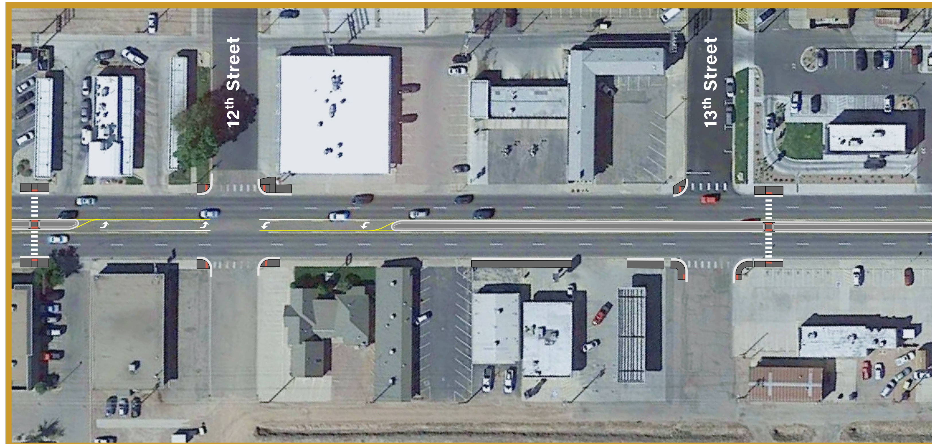
US 50 West Cañon City Access Control Plan Concept