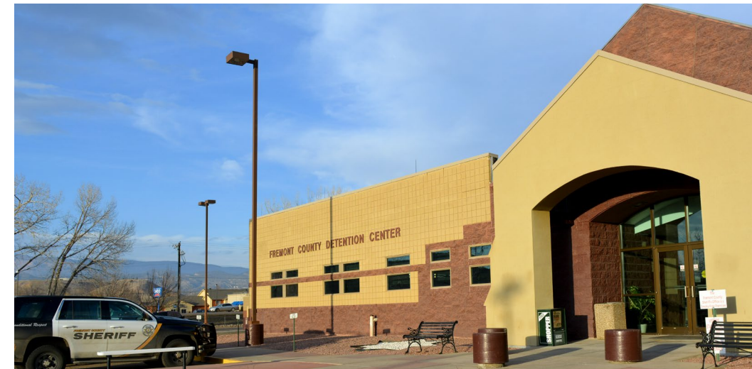
Fremont County Sheriff's Office: 100 Justice Center Rd, Cañon City • 719.276.5555