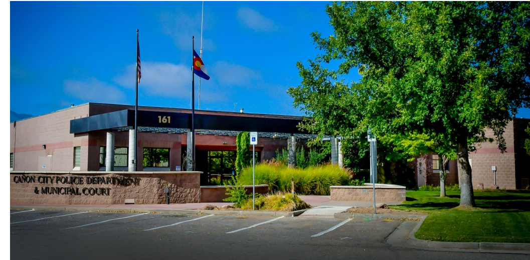
Cañon City Police Department: 161 Justice Center Rd, Cañon City • 719.276.5600